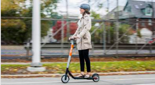
Spin's electric scooters are available in Corktown.

Electric Spin Scooters have come to Corktown. Here's what you need to know to pick one up: