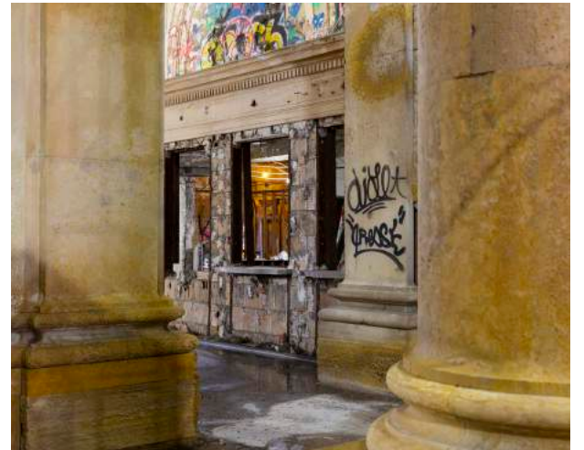
CCS photography student Ron Pickering captures train station details.

The project has drawn a lot of interest from CCS students, who are closely following Detroit's