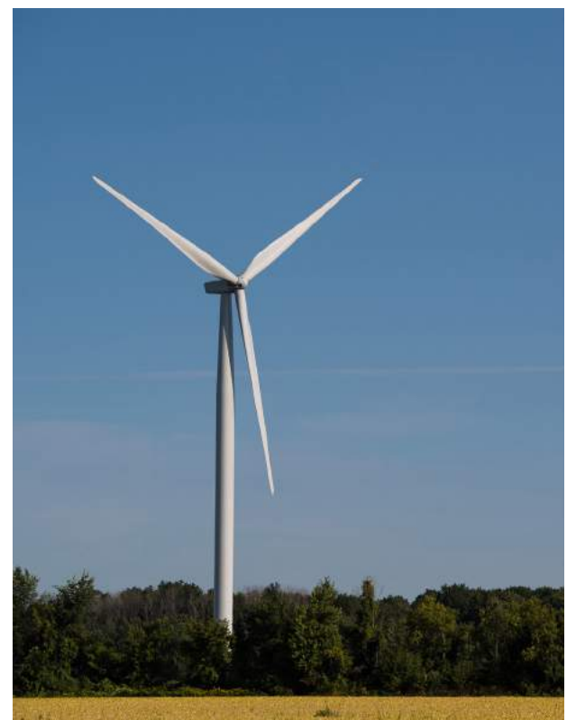
Wind energy will power Michigan Central Station and other Ford sites.

There won't be any wind turbines surrounding the renovated Michigan Central Station when it opens in 2022, but the iconic building and other Ford-owned properties in Corktown will be powered by locally sourced wind energy. Ford has committed to a substantial renewable energy procurement through DTE Energy's MIGreenPower program, which will provide 500,000 megawatt hours of locally sourced Michigan wind energy to Ford's Southeast Michigan portfolio — enough to provide electricity to about 48,000 homes for one year. In an effort to reduce its carbon footprint and support Michigan's clean-energy economy, Ford was the first company to announce its involvement with the energy program. Under the program, Ford's Dearborn Truck Plant (home of the Ford F-150 and the Ford Raptor), the Michigan Assembly Plant (home of the 2019 Ford Ranger) and several new buildings on the Ford Research and Engineering Campus in West Dearborn are also on target to be powered by 100 percent locally sourced renewable energy by January 2021.