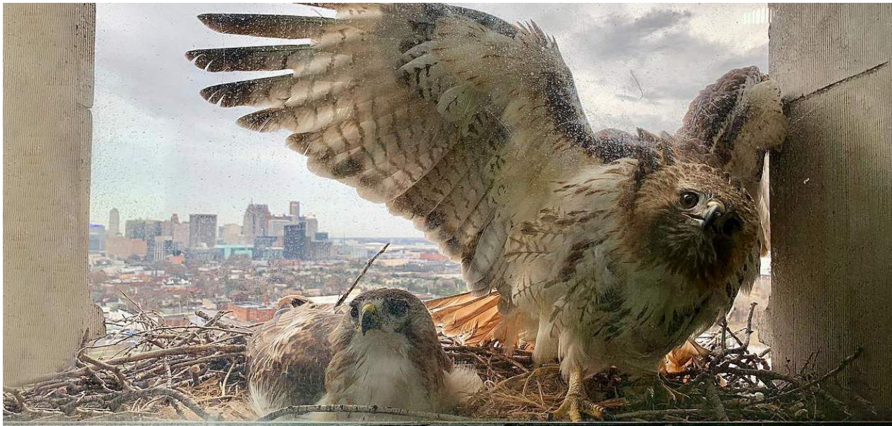
A couple of red-tailed hawks and their chicks nest at Michigan Central Station.

Red-tailed hawks are known to occupy just about every type of open habitat, including a window ledge of Michigan Central Station. With a commanding view of Detroit, two adult birds recently built a nest on the 12th floor of the station tower and in April two white speckled chicks hatched from their eggs. The juvenile hawks are expected to take their first flight within six weeks of life and the family will leave the nest soon afterwards, but will most likely stay in the neighborhood. Ford has taken steps to protect the privacy of the hawks by putting up a special window cover and invited a bird specialist to check on them. The expert noted that it is unusual to see