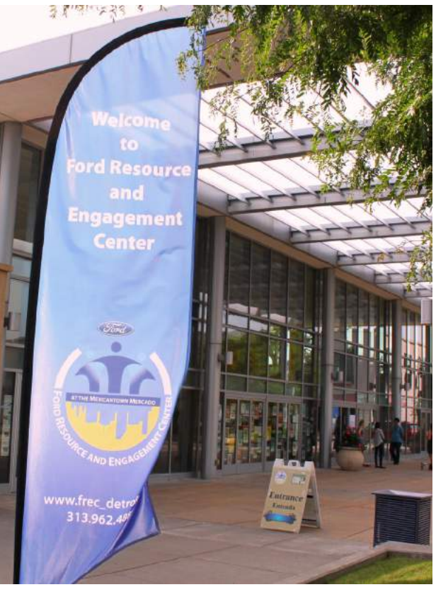
The FREC has been serving Southwest Detroit since 2013.

Did you know Ford has been a part of the Southwest Detroit community for years, well before our purchase of the station? One of our biggest projects has been the Ford Resource and Engagement Center, or FREC, at 2826 Bagley Street. The FREC is a major initiative of the Ford Motor Company Fund - Ford's philanthropic arm - which invests $20 million each year to strengthen the metro Detroit community. For the past five years, FREC Southwest has been offering community and social services including workforce development, free legal assistance, arts programs, English-language classes and even yoga at 2826 Bagley Street. It has proven so popular, we opened FREC Eastside at 15491 Maddelein Street. You can find some upcoming programs at the FREC Southwest in the events listings at right, or just drop by any time to say, "Hi."