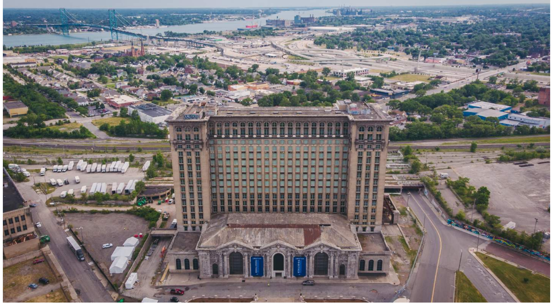
The\ iconic\ Michigan\ Central\ Station\ served\ as\ one\ of\ America's\ busiest\ transit\ hubs\ from\ 1913\ until\ 1988.