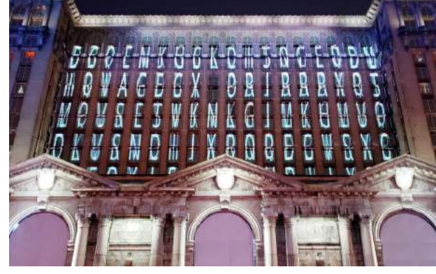
WINTER FESTIVAL, JANUARY 2019

Next time you post a shot of the train station or the neighborhood in action on social media, tag it #ForDetroit and #CreatingTomorrowTogether, and you might find it here (with your permission, of course).