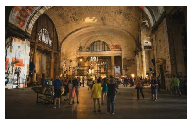
OPEN HOUSE, JUNE 2018