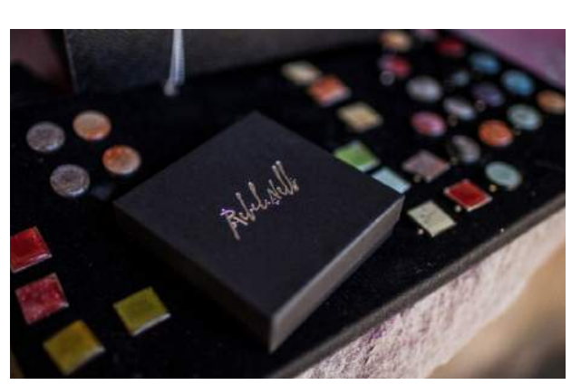
REBEL NELL'S MCS GRAFFITI JEWELRY