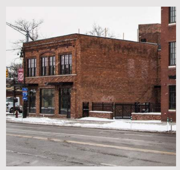
A storefront at the corner of Michigan Avenue and Rosa Parks Boulevard will soon be home to a Ford information center.

In the coming months, Ford will be opening an information center inside The Factory at 1907 Michigan Avenue. As part of our commitment to keeping the community informed about Ford's work here, the center will display highlights of our development plan, provide updates on other Ford-related activities in the area, as well as showcase a vision for the project. We invite you to come learn about our work and share your ideas.